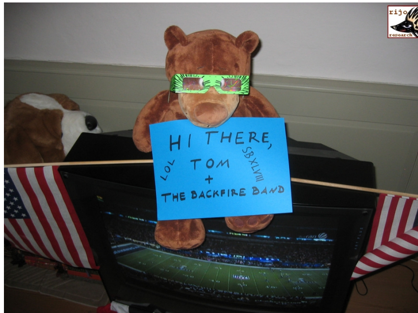
& also of the Backfire Band