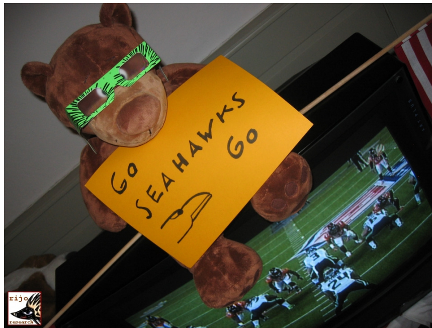
A Nuremberg Seahawks fan (with fancy glasses) ...

From our football bear Schorsch (Shorsh)